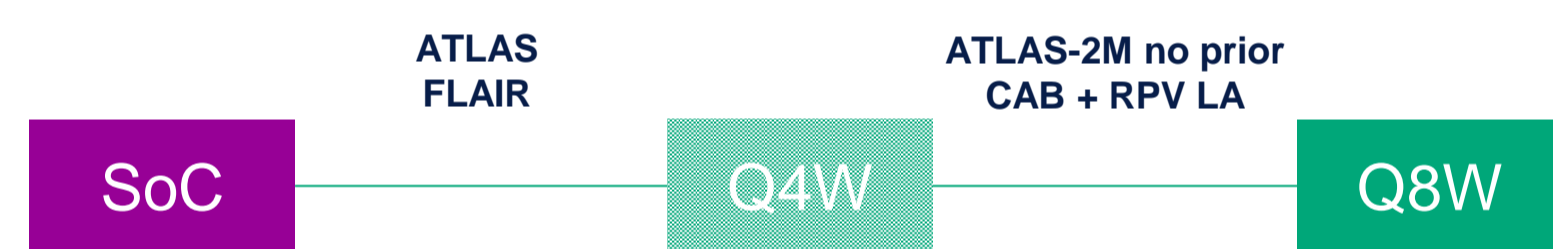
Figure 1. Diagram of Studies Included in the Indirect Comparison

CAB, cabotegravir; LA, long-acting; Q4W, every 4 weeks; Q8W, every 8 weeks; RPV, rilpivirine; SoC, standard of care.